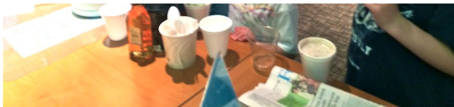
Whip cream shots for après ski Havdalah.