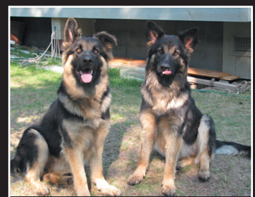
Reveille & Sprocket Wolff

Still looking for Jewish Pets of the Month! If you have a pet that you would like featured in our newsletter, please e-mail a picture to info@jhjewishcommunity.org .