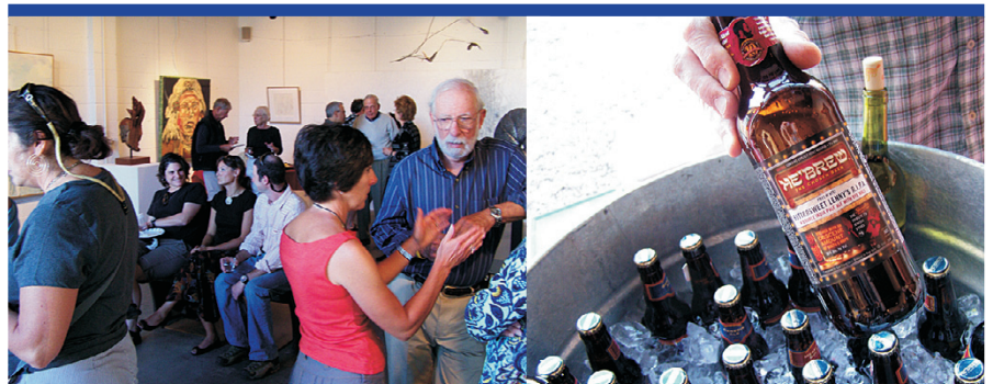
SCENES FROM THE 2007 MEMBERSHIP PARTY