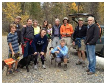
2012 Family Campers and dogs

POTLUCKS: Please bring a savory main dish or side dish to share. The JHJC will supply bagels and cream cheese, dessert and drinks.