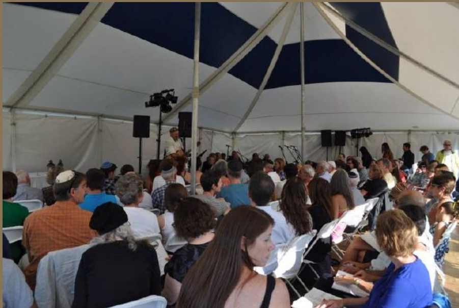
A record crowd of nearly 200 people attended Swingin' Sabbath!