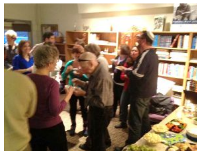
Oneg after March Shabbat at the new Center.