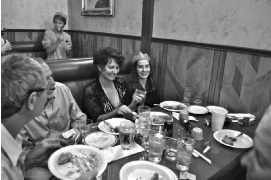
High Holidays 5774 Services