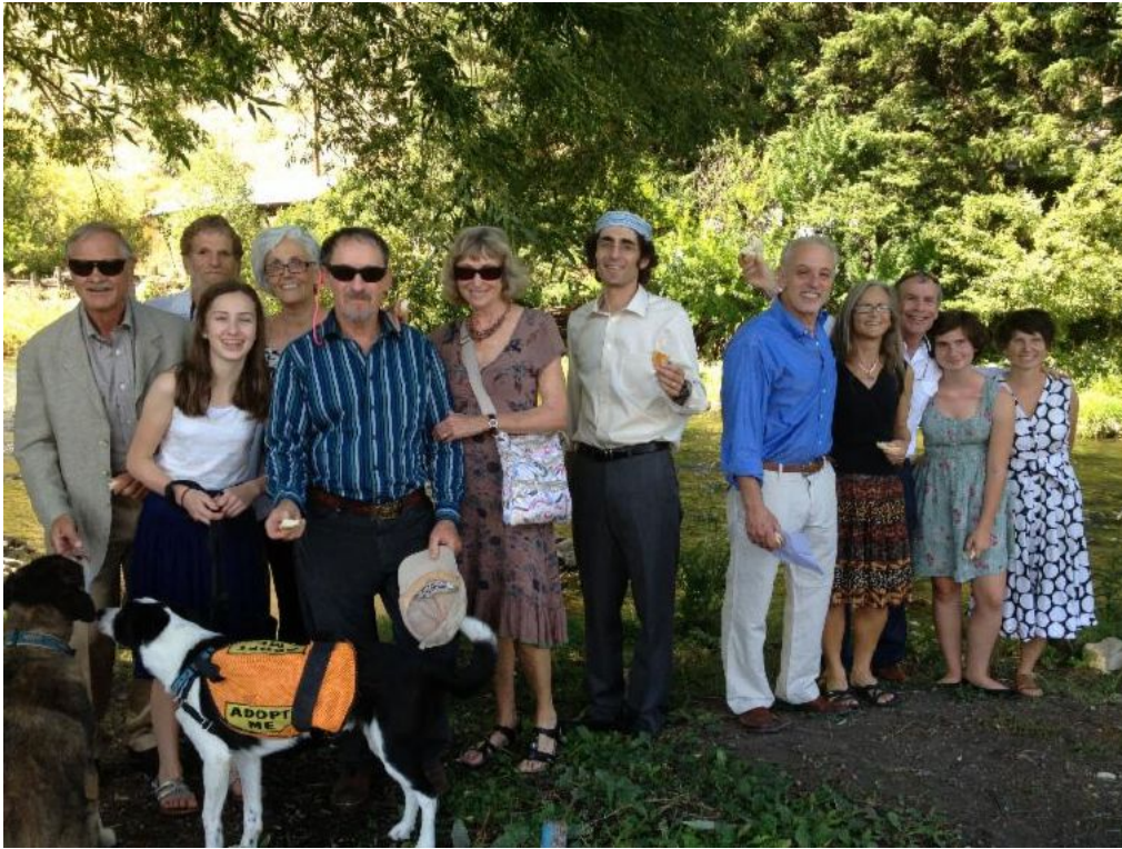
Tashlich (with a guest from the Animal Adoption Center)