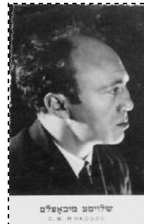
Yiddish/Russian actor and director Solomon Mikhoel

The Jackson Hole Jewish Community, Off Square Theatre Company, and the Russian Club of Jackson Hole present three documentary films celebrating Yiddish theater, literature, and music - and the struggle to preserve them. A discussion and reception with light refreshments will follow the screenings. Free and open to the public. Black Box Theatre at the Center for the Arts.