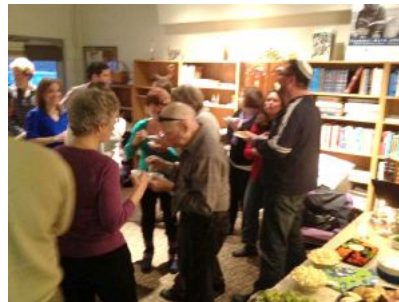
Oneg after March Shabbat at the new Center.