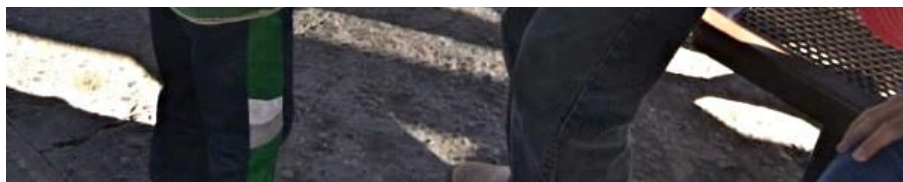
Simchat Torah 5774