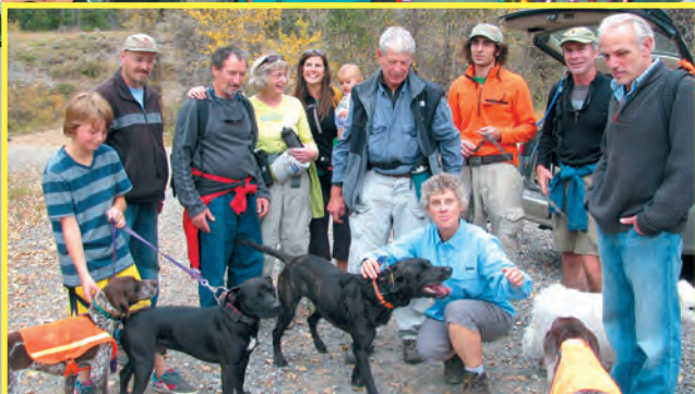
Family (Dog!) Camp at the Hatchet Ranch