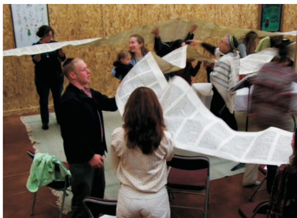
Members of the JHJC help hold the Torah as the entire scroll is unrolled.