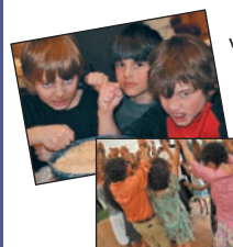
"Jackson Hole Jews"