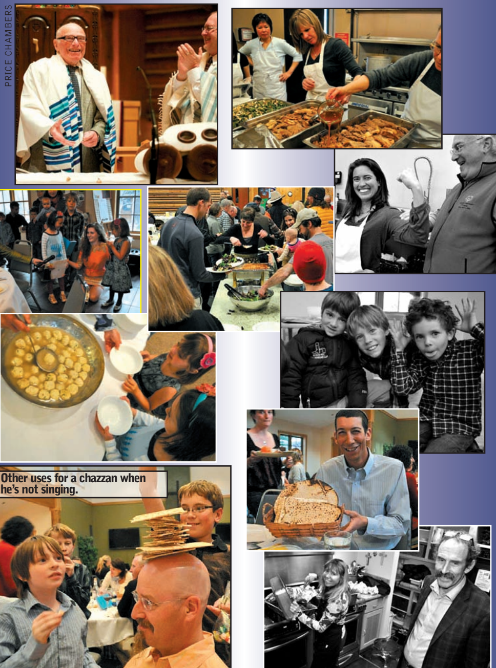
Other uses for a chazzan when he's not singing.