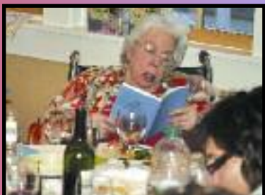
Holocaust Memorial Gathering 4.30.11