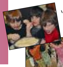
"Jackson Hole Jews"