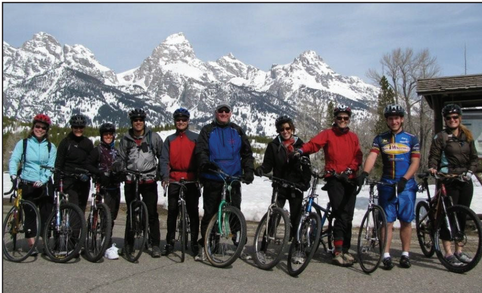
A minyon of bikers came out for a beautiful morning of riding through Grand Teton Nation Park in April.

The Jackson Hole Jewish Community will be conducting a spring food drive during the week of May 17 - 23. You can bring non-perishable items by our office at 480 S. Cache Suite #6 or to one of our events on May 22 & 23. Every contribution will be a help to the beneficiaries, and every contribution is important - from one can of food to many full grocery bags.