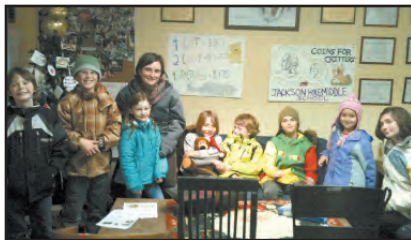
Students at the Animal Adoption Center.

We are donating the money raised to the Jackson Hole Jewish Community, the Animal Adoption Center (AAC), and the