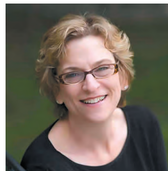
Author Anita Diamant

public event the last week of June with the esteemed author of The Red Tent , Day After Night , and the obliquitous The New Jewish Baby Book , Anita Diamant. We need committee members and an event leader to work with Anita on creating an interesting interfaith public event. Interested people please contact the JHJC at: info@jhjewishcommunity.org .