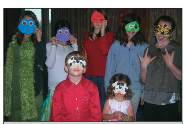
Children at the community Seder wore masks reminiscent of the ten plagues.