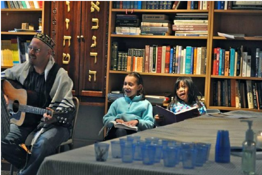
Singin' with Judd, one of the best things about Bet Sefer.