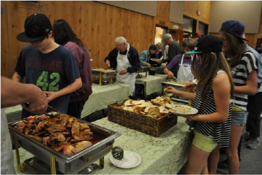
Brisket, egg noodles, salad, challah and homemade chocolate chip cookies were served up by JHJC members.