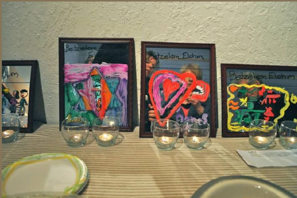
B'Tzelem Elohim was the theme for the annual Bet Sefer Shabbat in May.