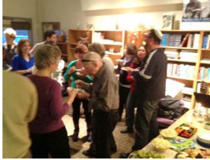
Oneg after March Shabbat at the new Center.