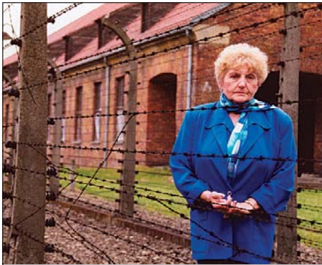
Forgiving Dr. Mengele

Who has the right to forgive a monster? Forgiving Dr. Mengele poses this question as we follow a Holocaust survivor with a dauntless