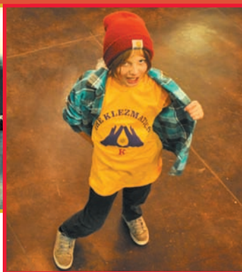
(Left and below) JHJC sponsors The Klezmatics to give a master class to the JH High School Band.