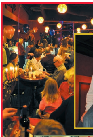
Annual Chanukah Party