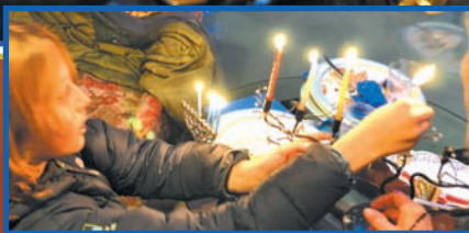
(below) Mitzvah Day at the Living Center on Dec. 25.