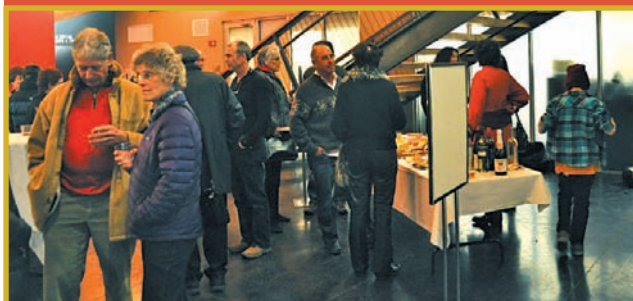
Klezomatics reception for JHJC members at the Center Theater.

The Klezmatics • Mountain Chai Gelt • Chanukah Party • Mitzvah Day