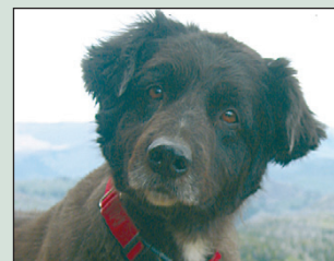
Stephen Abrams' dog Flash smiles for the camera at Huckelberry Lookout.