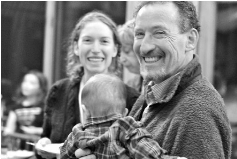
Three generations of Aronowitzes.