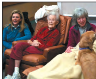
Mitzvah Day 2010

E. Leaven is located at 175 Center Street, just north of the Town Square.