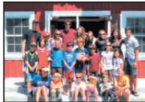
JHJC summer camp DVD cover

info@jhjewishcommunity.org. A sliding scale of dues is available upon request. We do not turn anyone away who wishes to be a member of the JHJC.