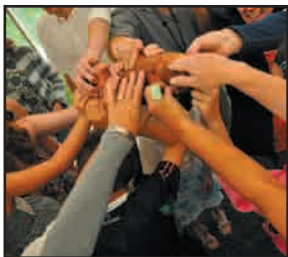
Celebrate JHJC membership

Being a member is the best way to support the Jackson Hole Jewish Community. It shows your commitment to having an active Jewish presence in Jackson, and your membership dues are the primary way to support the monthly programs and activities that keep our community vibrant. Membership applications have been mailed. If you did not receive one, please contact our office at