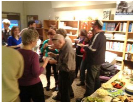
Oneg after March Shabbat at the new Center.