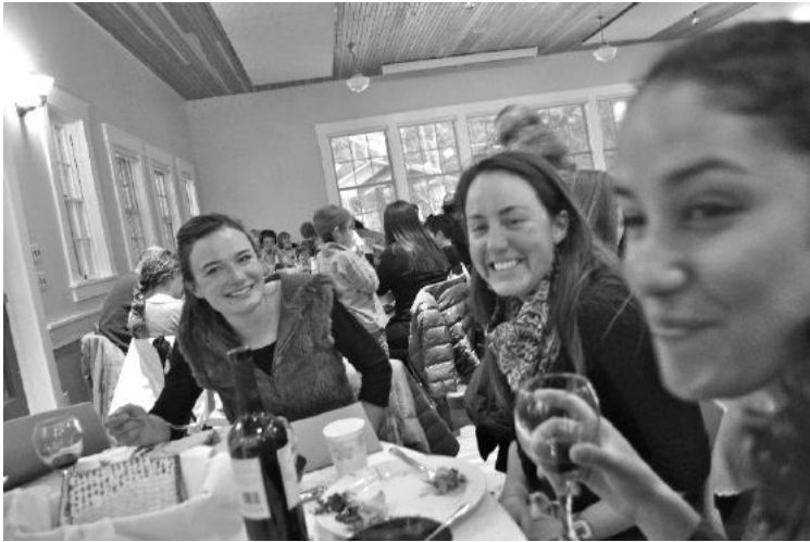
Big kids table.