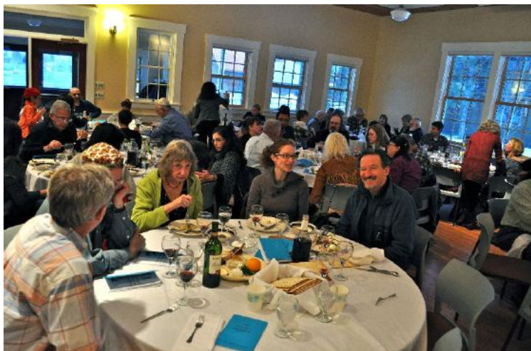
The Aronowitz gang.